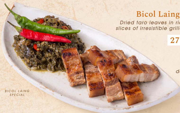
BICOL LAING SPECIAL