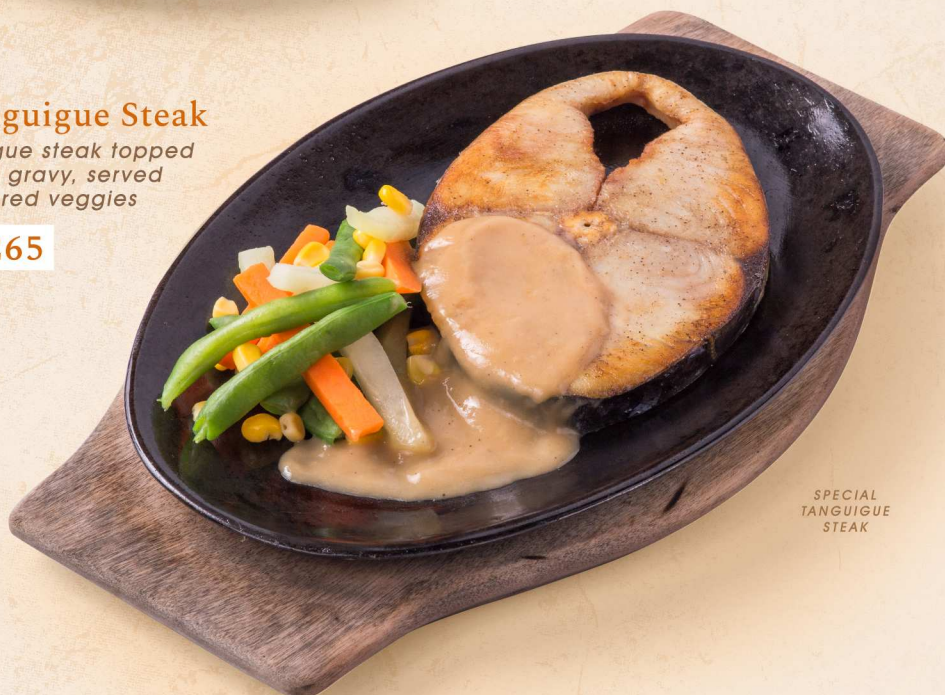
SPECIAL TANGUIQUE STEAK