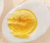
BLUE RIBBON SALAD