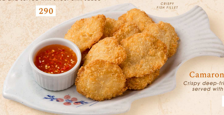
CRISPY FISH FILLET