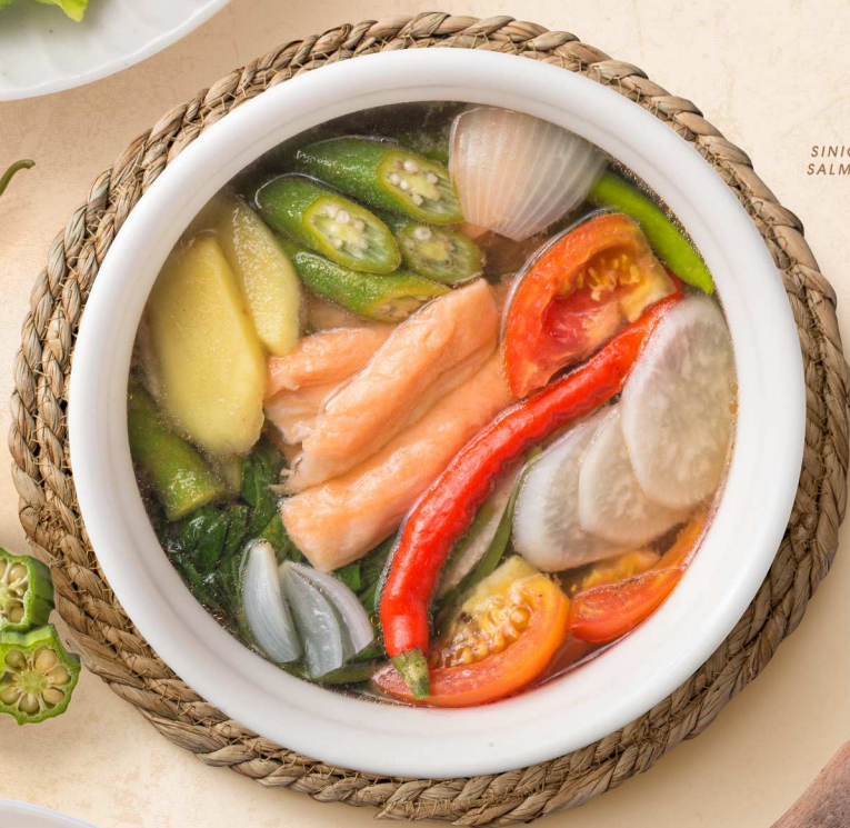
SINIGANG NA SALMON BELLY