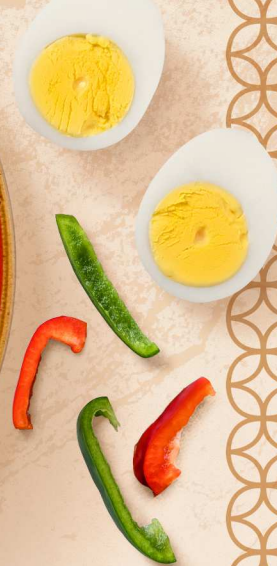
RED PLATTER CHICKEN