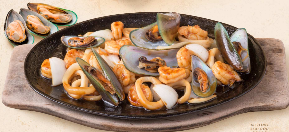
SIZZLING SEAFOOD COMBO